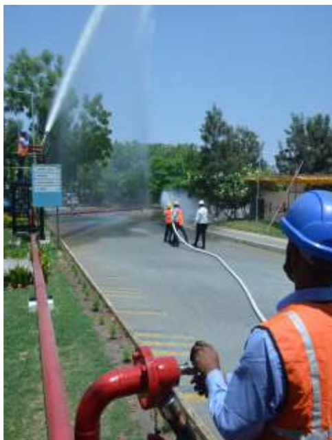
Testing and Commissioning