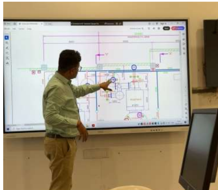
Explaining design engineering.